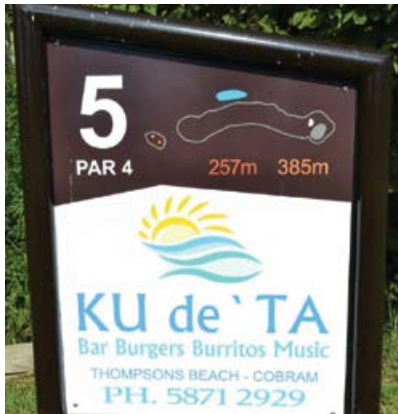
KU DE TA 03 5871 2929

Situated on Australia's largest inland Beach.