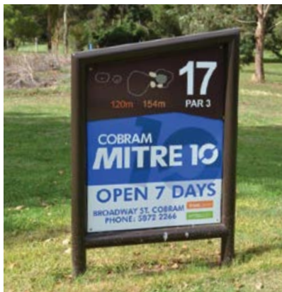
COBRAM MITRE 10 03 5872 2266