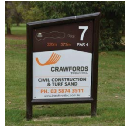
CRAWFORD'S TOCUMWAL 03 5874 3511