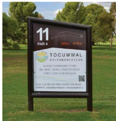
TOCUMWAL GOLF CLUB: 03 5874 9111