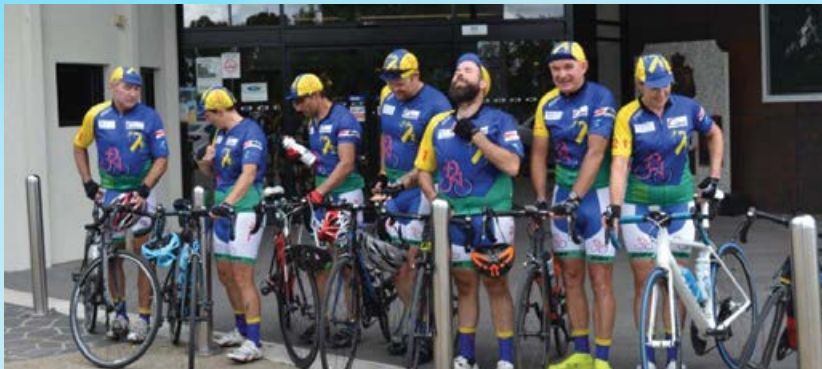
Picture: Tired riders arrive 'Home' at the Sporties after 321 gruelling kilometres.

'I thought I would teach my son about the world it turns out I need to teach the world about my son'. They see a little boy who can talk, I see a miracle who is beyond words.