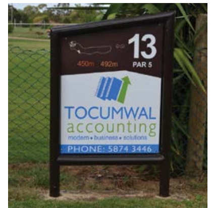
TOCUMWAL ACCOUNTING 03 5874 3446

Tee it high. Let it fly. To the perfect location for Weddings, Conferences and Golf on Tocumwal's Clubhouse sitting on two 18 hole Golf Courses Tocumwal with its 2 Championship 18 hole golf courses is perfectly located as the gateway to New South Wales and Victoria and is only 3 hours drive from Melbourne. When you arrive at the friendly town of Tocumwal you can book at any one of a variety of accommodation venues, all within easy walking distance of the first tee. For that golfing holiday to remember.